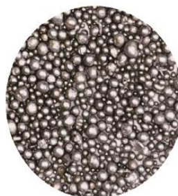
Stainless Steel Cut Wire Shot