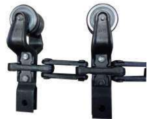
X458 chain hanging arm combination