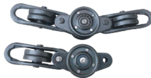
150 type UH-5075-S