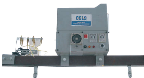
Auto Lubricator for conveyor chain system