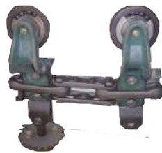
X348 chain track combination