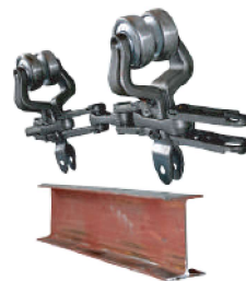
458 type with trolley