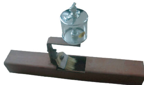
Manual oil cup