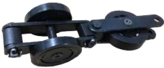
250 single hanger chain