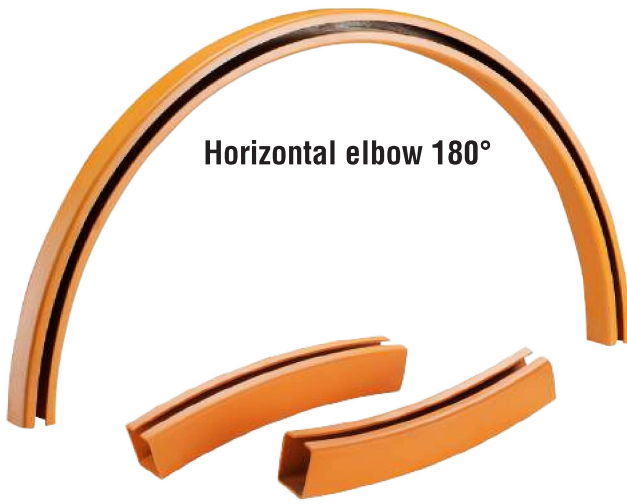
Horizontal elbow 180°